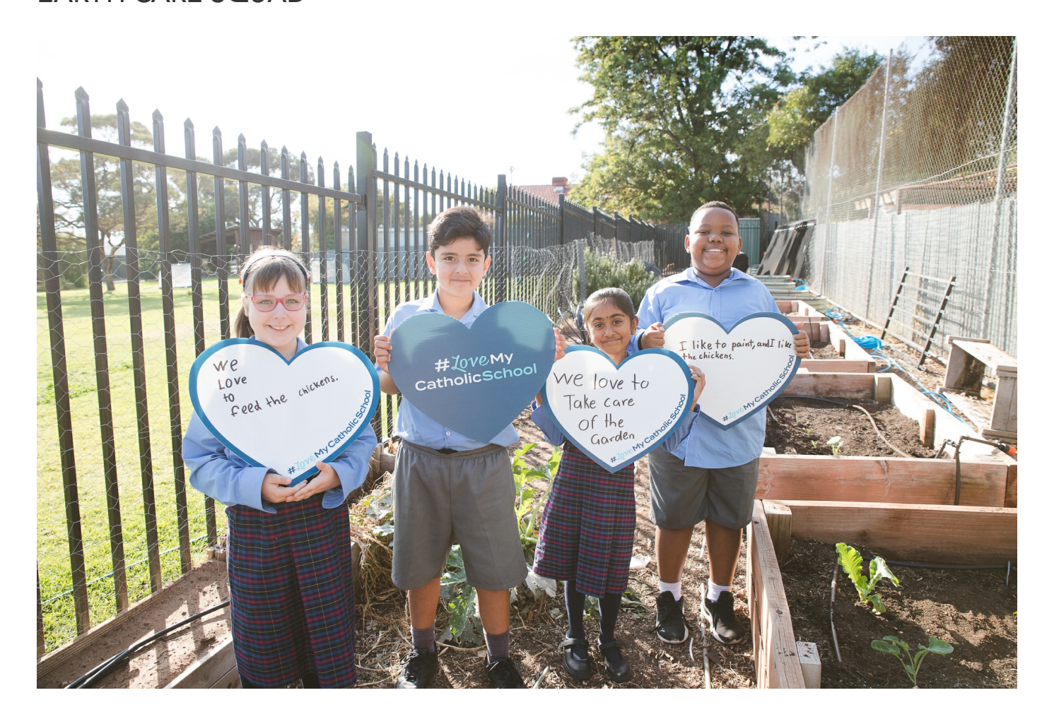
The Earth Care Squad members are planting vegetables in the garden which will coincide with Laudato Si Week. Laudato Si calls us to care for God's creation and recognise the blessings we have been provided in the natural world.